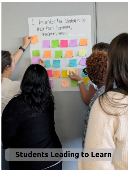
Students Leading to Learn

The images below show EdCo members leading sessions that give educators meaningful space to learn together and bring fresh ideas back to their classrooms.