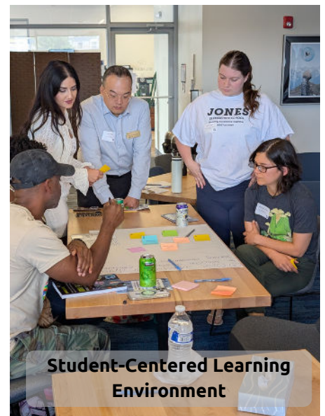
Student-Centered Learning Environment